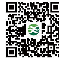
WeChat Official Account

Official Website www.chinafranchiseexpo.com